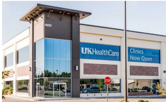
UK Healthcare at Turfand