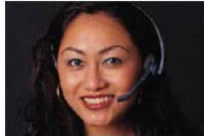
Employees who spend a lot of time on the phone should use a headset to minimize risk factors