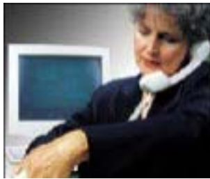
Hazardous posture created during phone use